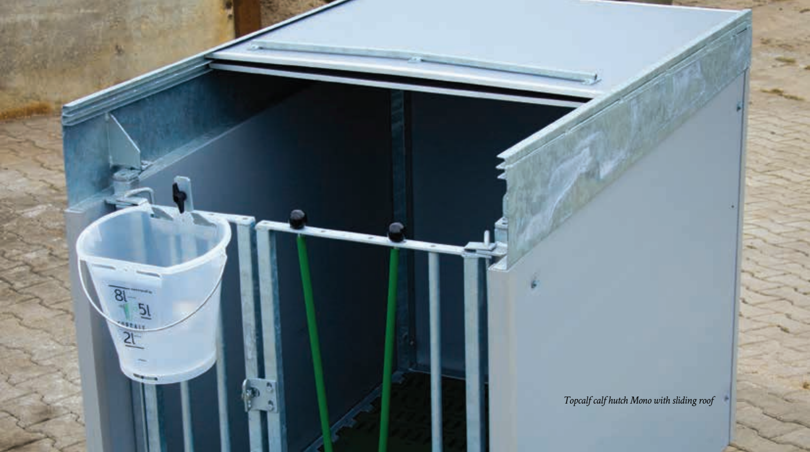
Topcalf calf hutch Mono with sliding roof