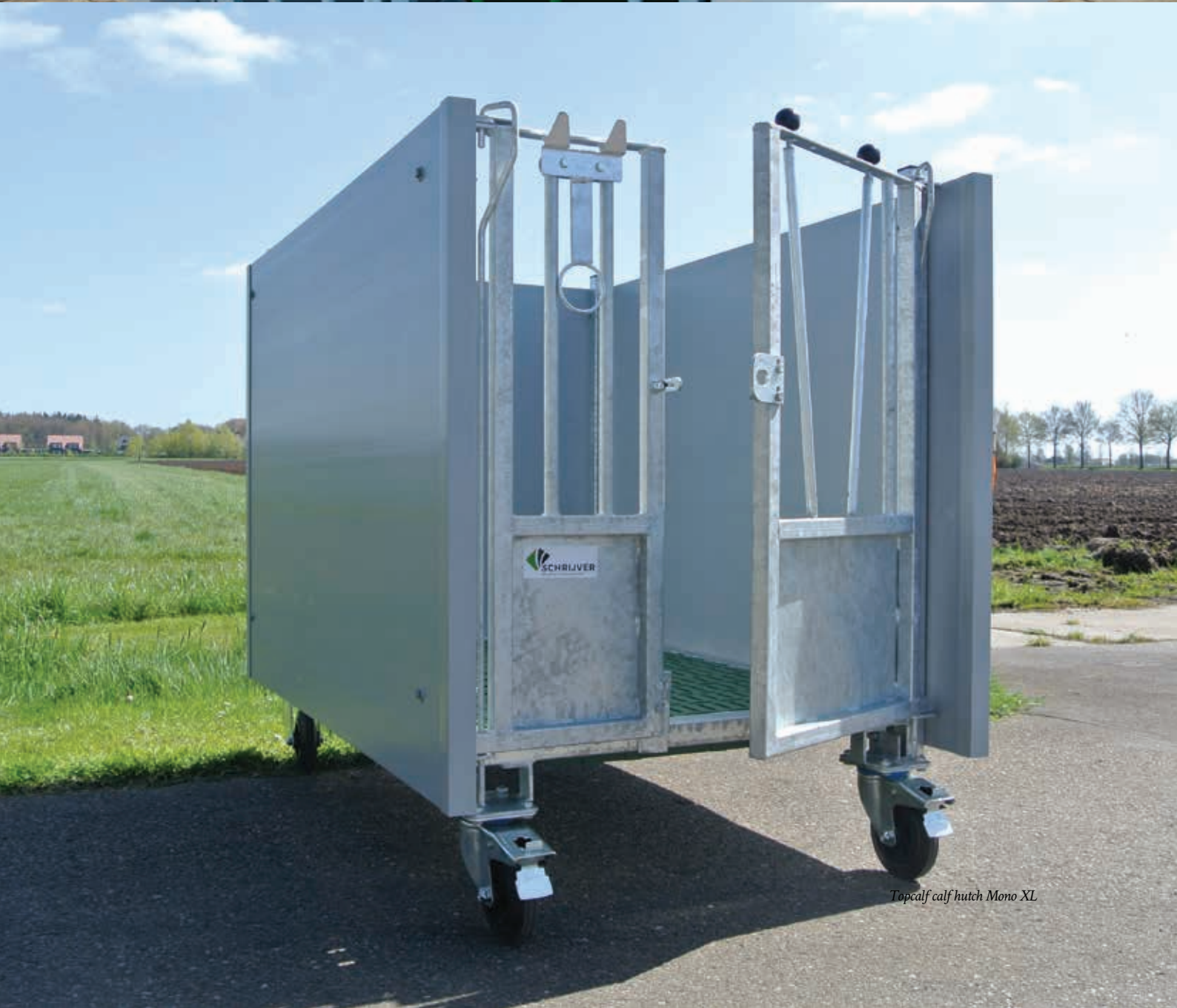
Topcalf calf hutch Mono XL